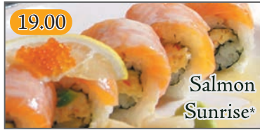
19.00 Avocado, spicy crab salad topped with seared salmon, honey mustard sauce and tobiko