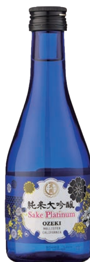
Ozeki Junmai Daiginjo 300ml $15