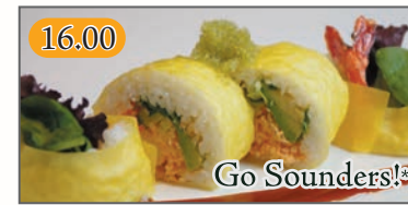
16.00 Shrimp tempura, spicy crab salad, mixed greens, avocado, cucumber, rolled with soy paper, topped with eel sauce and wasabi-tobiko

Go Storm!* 16.00 Creamy scallop, shrimp, avocado, cucumber, tempura asparagus rolled with soy paper, wasabi-tobiko and eel sauce