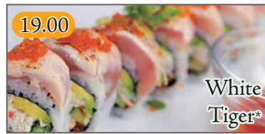
19.00 Spicy crab salad, scallop, avocado topped with seared albacore and tobiko, side of Miyabi's special sauce