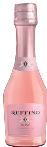
Rosé Sparkling 187ml $14