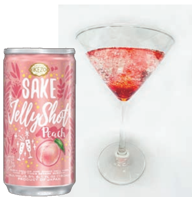
Peach Jelly Martini $13