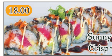
18.00 Tempura style roll with tuna, salmon, crab salad, eel, cream cheese and avocado topped with mayo, eel sauce, tobiko and scallion