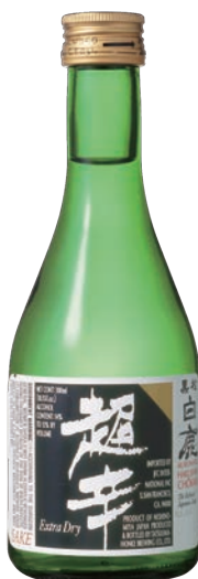
Hakushika Junmai Extra Dry 300ml $15