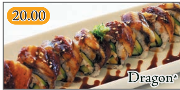
20.00 California roll topped with eel slices, scallion, sesame seeds and sweet eel sauce