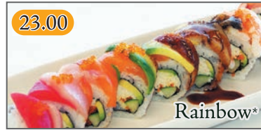
23.00 California roll topped with assorted fish, unagi, avocado and tobiko