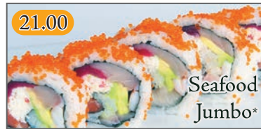
21.00 Tuna, salmon, albacore, shrimp, crab salad, scallop, yellowtail, shiso, avocado and tobiko