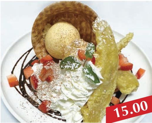
Miyabi Banana Tempura & Ice Cream