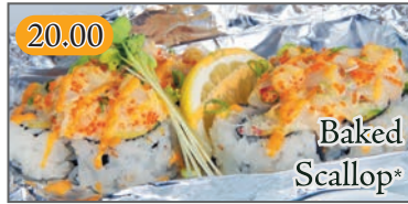
20.00 Eel and avocado roll topped with baked creamy scallop and crab salad, spicy mayo, eel sauce and tobiko