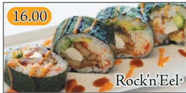
16.00 Tempura eel, crab salad, avocado, cream cheese, cucumber and tobiko topped with spicy mayo and eel sauce