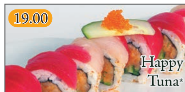
19.00 Spicy tuna and cucumber topped with tuna, albacore and tobiko