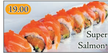
19.00 Spicy salmon, cucumber, radish sprouts topped with salmon slices and tobiko

California* 10.00 Crab Salad, avocado, cucumber, sesame seeds and tobiko