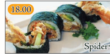
18.00 Crispy soft shell crab, cucumber, avocado, tobiko and mayo

Bomb Tuna* 15.00 Spicy tuna, cucumber and habanero masago rolled seaweed outside