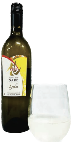
Lychee Sake Glass $10 Bottle $30