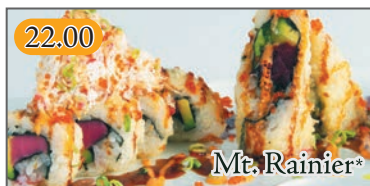
22.00 Tempura style tuna and avocado roll topped with crab salad, spicy mayo, eel sauce, tobiko and scallion