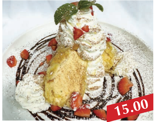
Miyabi Tempura Ice Cream