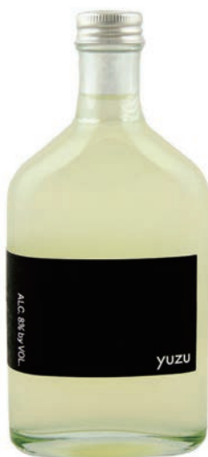
Shibata Yuzu Sake 300ml $21