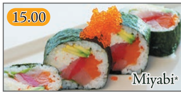
15.00 Tuna, yellowtail, salmon, albacore, crab salad, avocado and tobiko