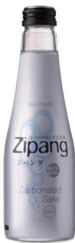
Zipang Sparkling Sake 250ml $15