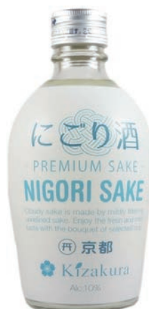
Kizakura Nigori Sake unfiltered sake 300ml $15