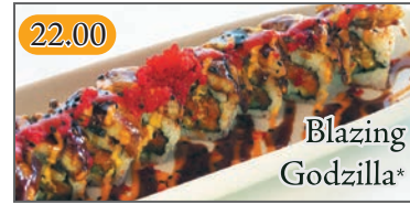
22.00 Spicy tuna and cucumber topped with eel slices, spicy sauce, spicy mayo, habanero masago, eel sauce and black sesame