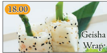
18.00 Baked snow crab salad, asparagus, avocado and tobiko rolled with soybean paper